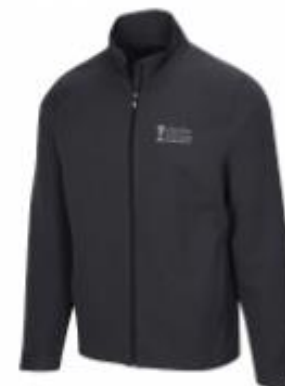
Volunteer MEN Jacket