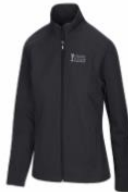
Volunteer WOMEN Jacket