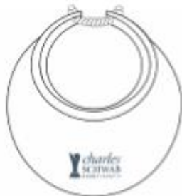
Volunteer WOMEN Visor