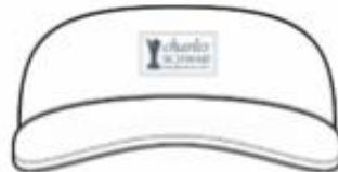
Volunteer Unisex Visor