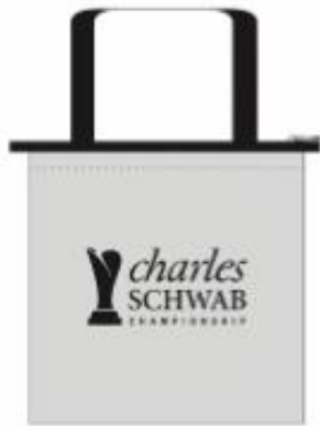
Volunteer Clear Tote