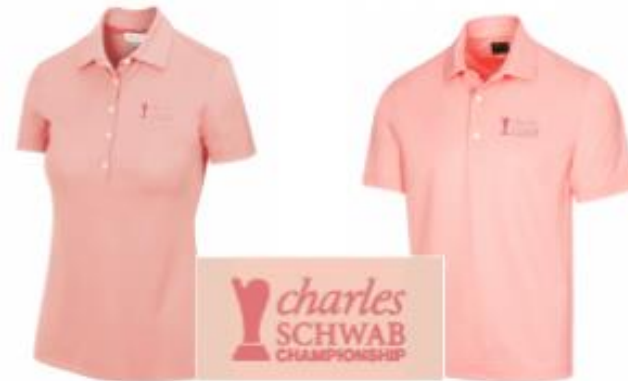
Volunteer WOMEN Polo