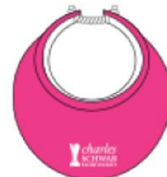
Volunteer WOMEN Visor