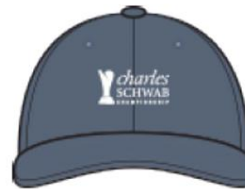
Volunteer Baseball Hat