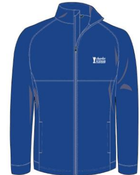
Volunteer MEN Jacket – 3XL