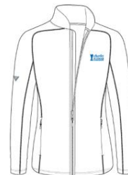
Volunteer WOMEN Jacket