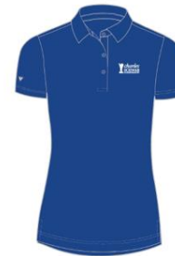
Volunteer WOMEN Polo