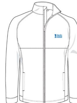
Volunteer MEN Jacket