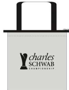
Volunteer Clear Tote