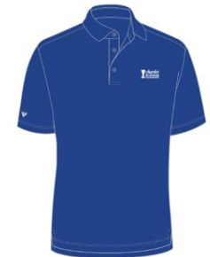
Volunteer MEN Polo